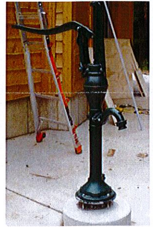
Hand Pump Well