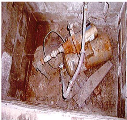
1.25" well (with jet pump) Buried Wellhead