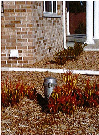
4" Water Well