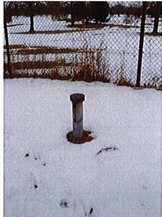
4" monitoring well