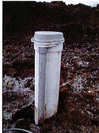
5" Water Well